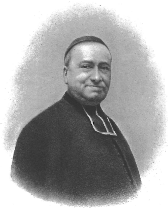
ABBÉ CONSTANT FOUARD